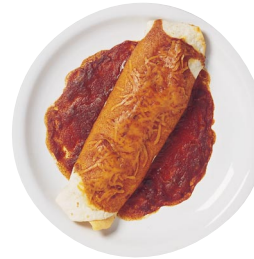
Burrito held 3 hours in a Competitor's Holding Cabinet Food Temp: 161°F (72°C) Shrink: 23.3%