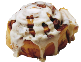
Bun held 3 hours in Competitor's Holding Cabinet