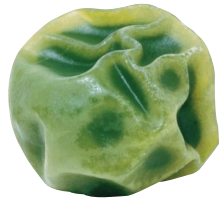
Pea held 2 hours in Competitor's Holding Cabinet Food Temp: 152°F (67°C)