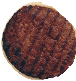
Hamburger held 3 hours in a CVap Holding Cabinet Food Temp: 162°F (72°C) Shrink: 3.4%