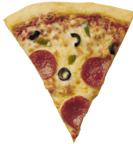
Pizza held 2 hours in Competitor's Holding Cabinet Food Temp: 135°F (57°C) Shrink: 7%