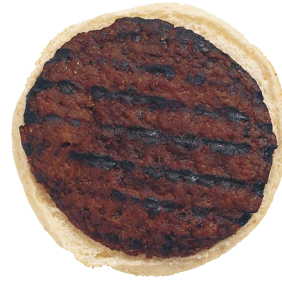
Hamburger held 3 hours in a Competitor's Holding Cabinet Food Temp: 153°F (67°C) Shrink: 24.5%