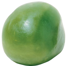
Pea held 2 hours in a CVap Holding Cabinet Food Temp: 152°F (67°C)