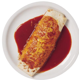
Burrito held 3 hours in a CVap Holding Cabinet Food Temp: 164°F (73°C) Shrink: 2.5%