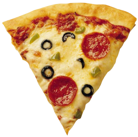
Pizza held 2 hours in a CVap Holding Cabinet Food Temp: 150°F (66°C) Shrink: 3%