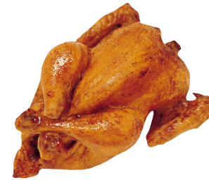
Chicken held 3 hours in a CVap Holding Cabinet Food Temp: 154°F (68°C) Shrink: 1.9%