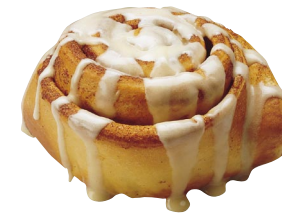
Bun held 3 hours in a CVap Holding Cabinet