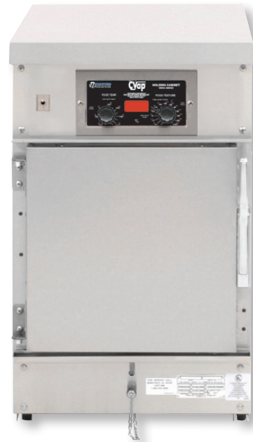
HA4503 CVAP® HOLDING CABINET HALF SIZE UNDER COUNTER MODEL WITH FAN Electronic Differential Control

CVap equipment complies with domestic and international requirements such as UL, C-UL, UL Sanitation, CE, MEA, and others.