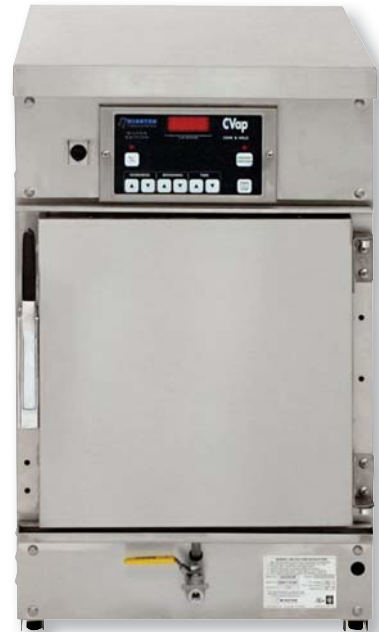
CAC503 CVAP® COOK & HOLD OVEN HALF SIZE UNDER COUNTER MODEL WITH FAN 8000 Series Electronic Controls

CVap equipment complies with domestic and international requirements such as UL, C-UL, UL Sanitation, CE, MEA, and others.