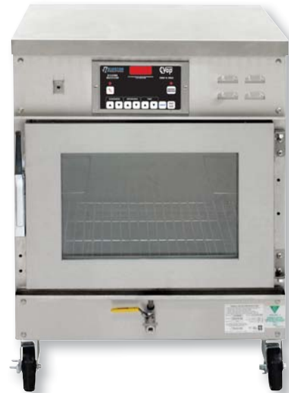
CAC507 CVAP® COOK & HOLD OVEN HALF SIZE UNDER COUNTER MODEL WITH FAN 8000 Series Electronic Controls

CVap equipment complies with domestic and international requirements such as UL, C-UL, UL Sanitation, CE, MEA, and others.