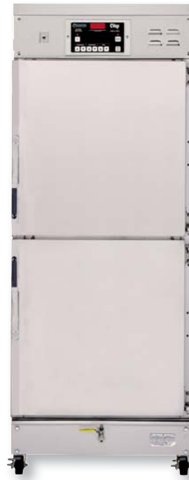
CAC522 CVAP® COOK & HOLD OVEN FULL SIZE MODEL WITH FAN 8000 Series Electronic Controls

CVap equipment complies with domestic and international requirements such as UL, C-UL, UL Sanitation, CE, MEA, and others.