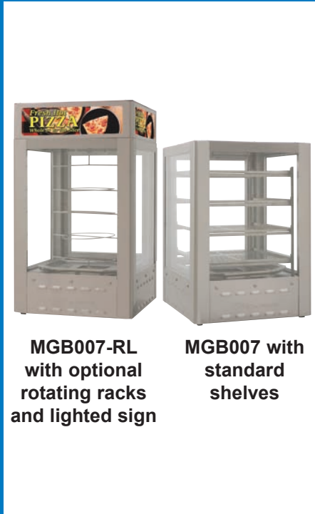
MGB007-RL with optional rotating racks and lighted sign