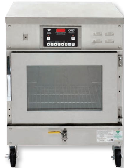
CAC507 CVAP® COOK & HOLD OVEN HALF SIZE UNDER COUNTER MODEL WITH FAN 8000 Series Electronic Controls

CVap equipment complies with domestic and international requirements such as UL, C-UL, UL Sanitation, CE, MEA, and others.